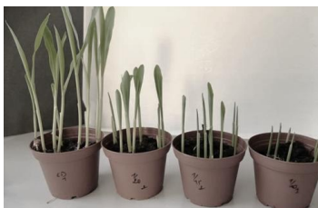
Figure 3: The Usage of MF Retention in Three Concentrations (1/25, 1/20, and 1/15) for Crop

The impacts of MF retention were first analyzed on corn to examine the advantages of the filtering method on the agricultural benefits of OMS.